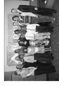
Stokes Beard Elementary students won the elementary division of the Stock Market Game in spring 2010 by increasing their $100,000 portfolio to $130,510 in the 10 week competition.