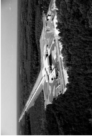
Laser Interferometer Gravitational-wave Observatory in Livingston, Louisiana. Each of the two arms is 4 kilometers long. LIGO has another such observatory in Hanford, Washington.

Find out more about LIGO at http://www.ligo.caltech.edu/ . The Space Place has a LIGO explanation for kids (of all ages) at http://spaceplace.nasa.gov/en/kids/ligo , where you can "hear" a star and a black hole colliding!