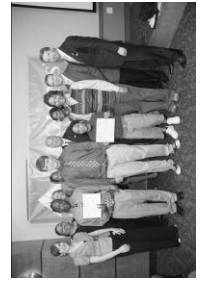
Lee Middle Students won the Mississippi Stock Market Game for spring 2010 by increasing their $100,000 portfolio to $137,320 in the 10 week competition.