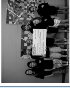
Madison Station Elementary 2nd grade Pathways students donated $2400 to the Red Cross Disaster Relief Fund. They raise the money by making and selling gifts and toys from recyclables.