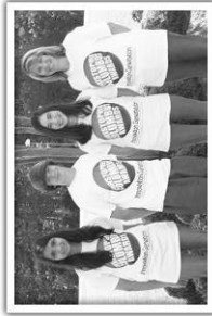
Madison Middle School Arthritis Magic team wins Grand Prize in Christopher Columbus competition.