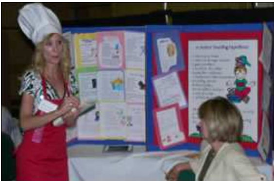
MS teachers were cooking up bright ideas at Creativity Night!